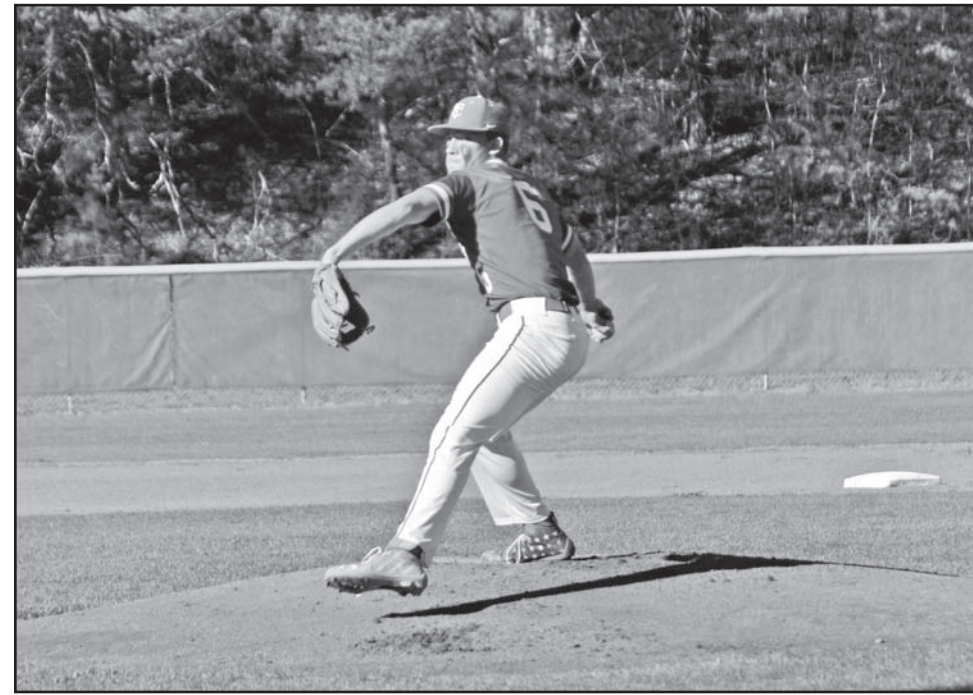
Towns County pitching fanned 10 Panthers in Monday's 7-5 victory.

Towns and Union will meet in a rematch on Mon-First pitch is scheduled for